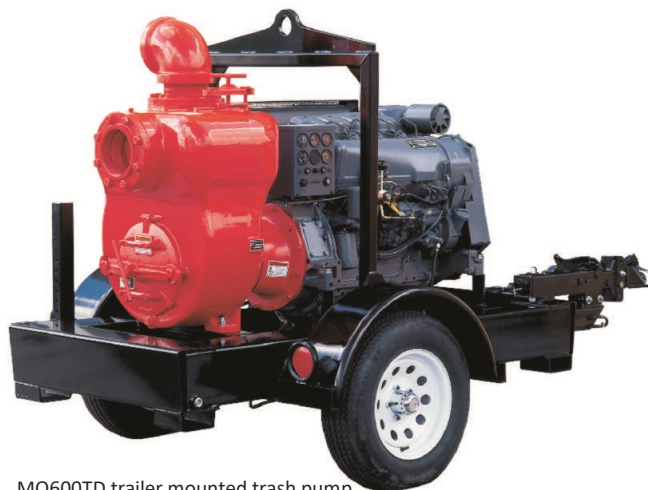
MQ600TD trailer mounted trash pump